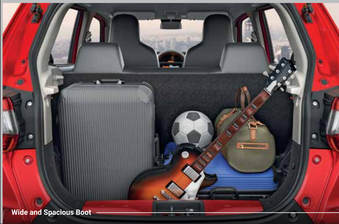
Wide and Spacious Boot

Open the doors and the S-PRESSO simply invites you to a world of never-ending excitement. All thanks to the commanding high-view seating that lets you scope the fun around you. Plus, its Dynamic Center Console, first-in-its-class Steering-Mounted Audio and Voice Controls and swanky colour accents make you feel alive, even before you drive out.