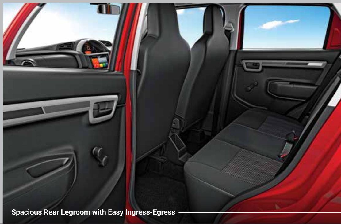
Spacious Rear Legroom with Easy Ingress-Egress